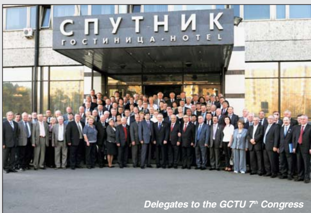
Delegates to the GCTU 7 th Congress

As decided by the Congress, the Confederation concentrates its efforts on the promotion of social development, and the improvement of the human and workers' rights situation in all New Independent States where there are GCTU affiliates.