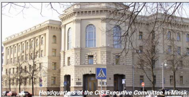
Headquarters of the CIS Executive Committee in Minsk

Over the last few years, more than 100 legal acts have been prepared for the CIS and the EurAsEC on the initiative of the GCTU or with its direct involvement.