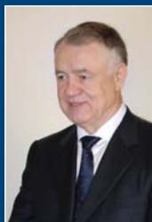
General Secretary of the GCTU Vladimir Scherbakov