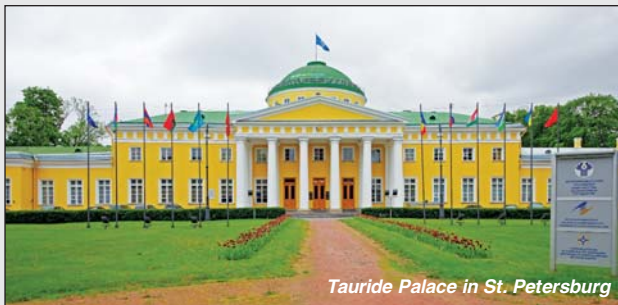
Tauride Palace in St. Petersburg

The GCTU cooperates on a permanent basis with interstate, inter-parliamentary and intergovernmental organisations, and participates in the elaboration and expert appraisals of international agreements and legislative acts. In this way it contributes towards the establishment of a single economic, social and humanitarian space within the CIS.