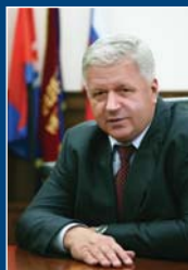
President of the GCTU Mikhail Shmakov